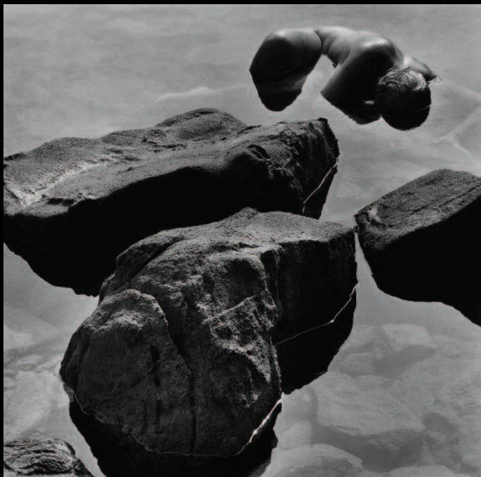
Bottom right: Metamorphosis 1996